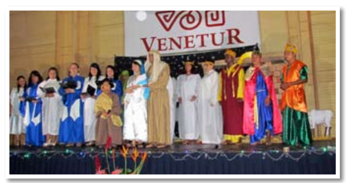
East Venezuela convention

There were exhibitions of materials produced by various conferences, Bible musical dramas, and inspiring testimonies of the children that were won to Christ. This is one of the few unions that subsidized 45% of the cost of the Gracelink Sabbath School lessons. The union officers were all there and were excited to put children as priority. Praise the Lord!