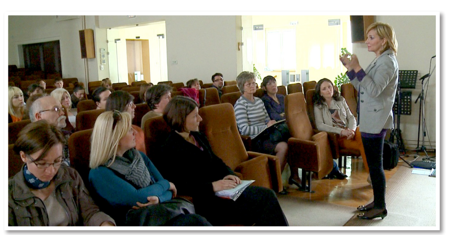
Sex Abuse seminar participants

We believe that God's will is to protect the weak and helpless because God's Word bid us to do that especially helping children and families affected by sexual abuse.