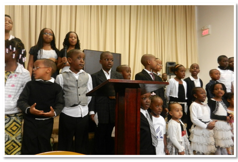
Children's day - Angaza Sharon Church in Delaware